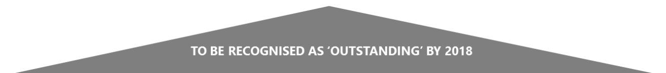
Graphic 2: Benson C of E Primary School Goal

What is a Goal? A goal is an aim that the organisation is wanting to achieve. This should link to the overall mission and vision