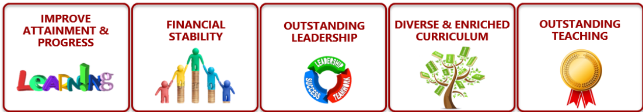
Graphic 3: Benson C of E Primary School Strategic Pillars

What is are Strategic Pillars? Pillars provide strength and support for something. In the case of strategy formulation, strategic pillars hold up the overall vision. Remove a pillar, and the vision is in risk of collapse. The pillars are the key areas of focus in order to achieve the overall goal, mission and vision.