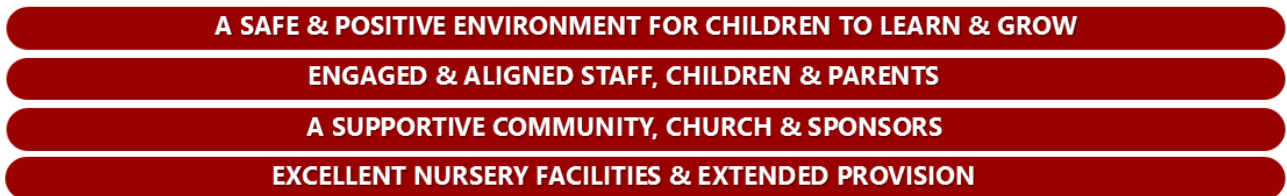
Graphic 4: Benson C of E Primary School Enablers

What is are Enablers? Enablers are the 'foundations' of the pillars. They are the key policies, people or processes that enable an organisation to deliver against the strategic pillars, goal, mission and vision.